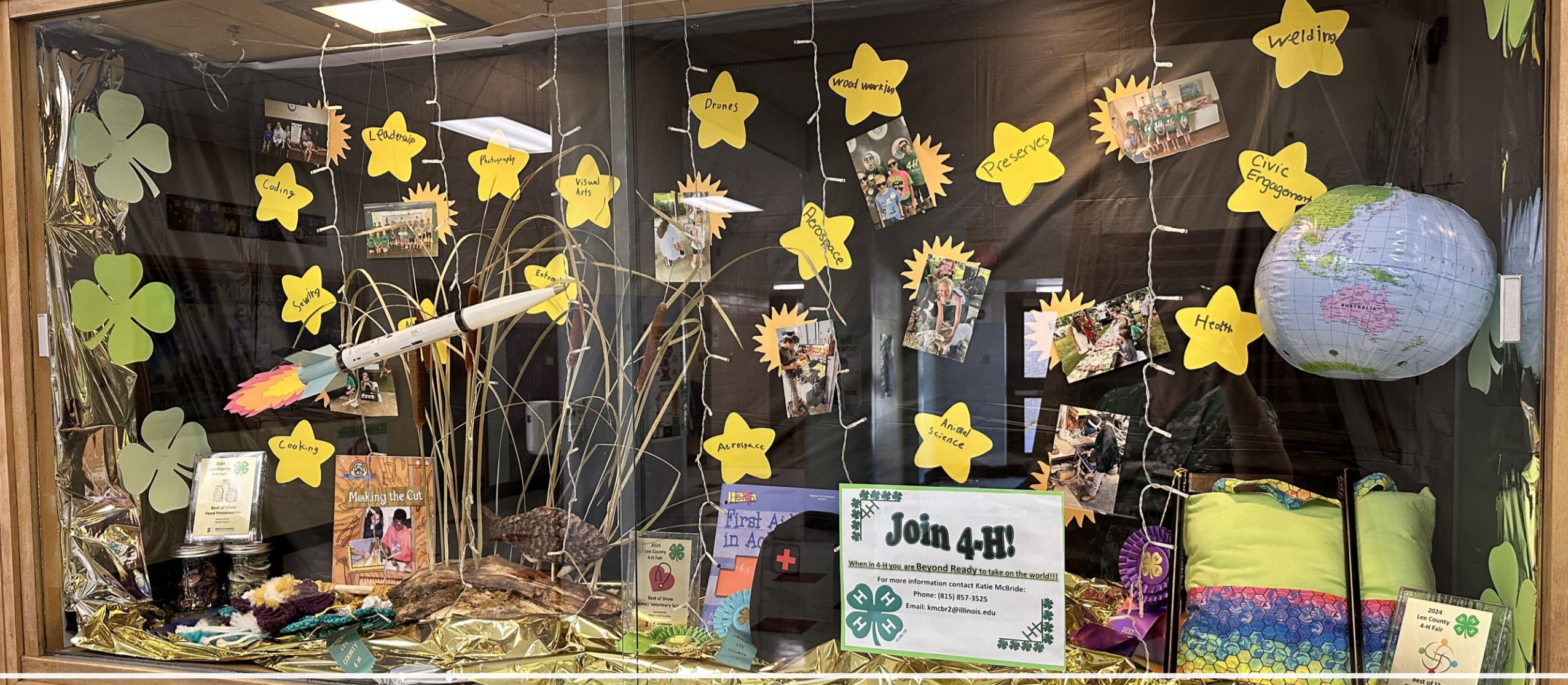
4-H Pride in Lee County: Promoting Membership During National 4-H Week