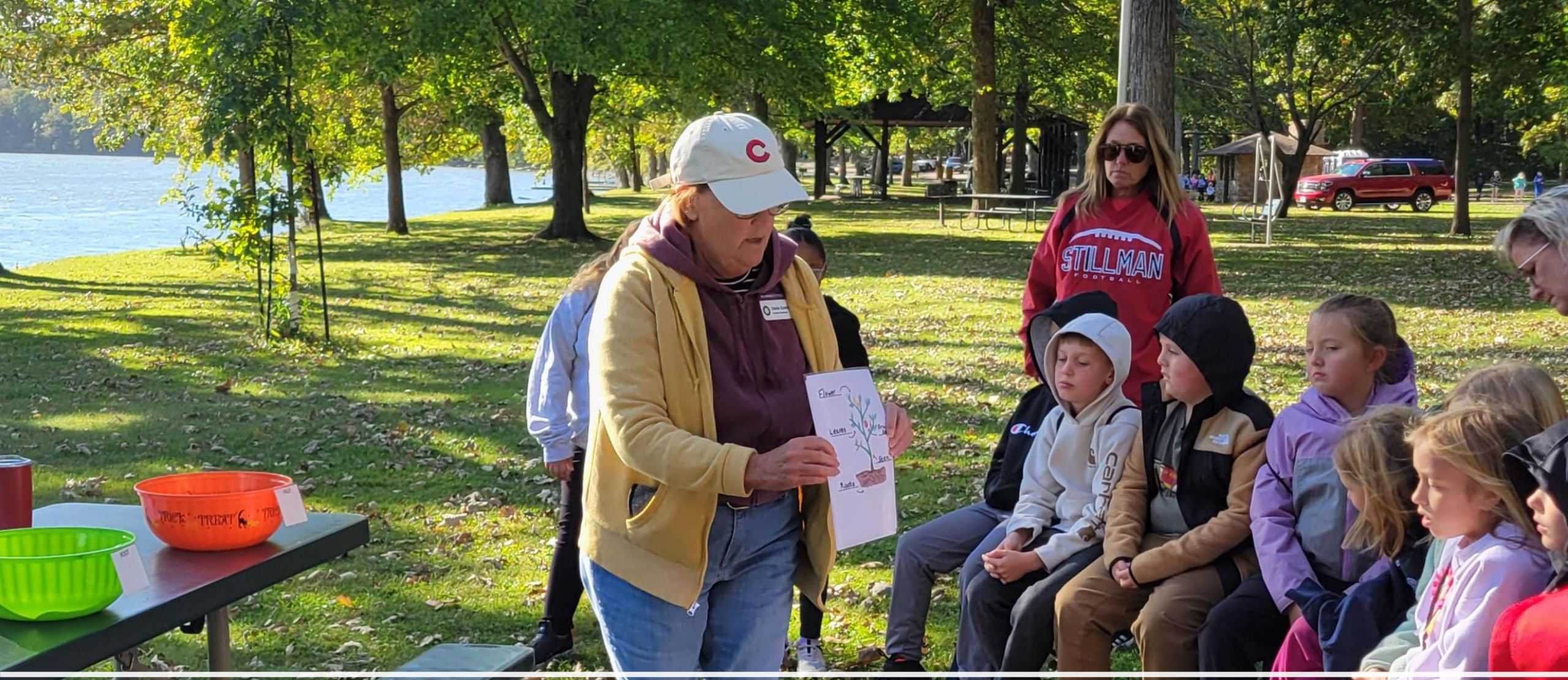
From Root to Fruit: A Day of Discovery for Lee County 3 rd Graders